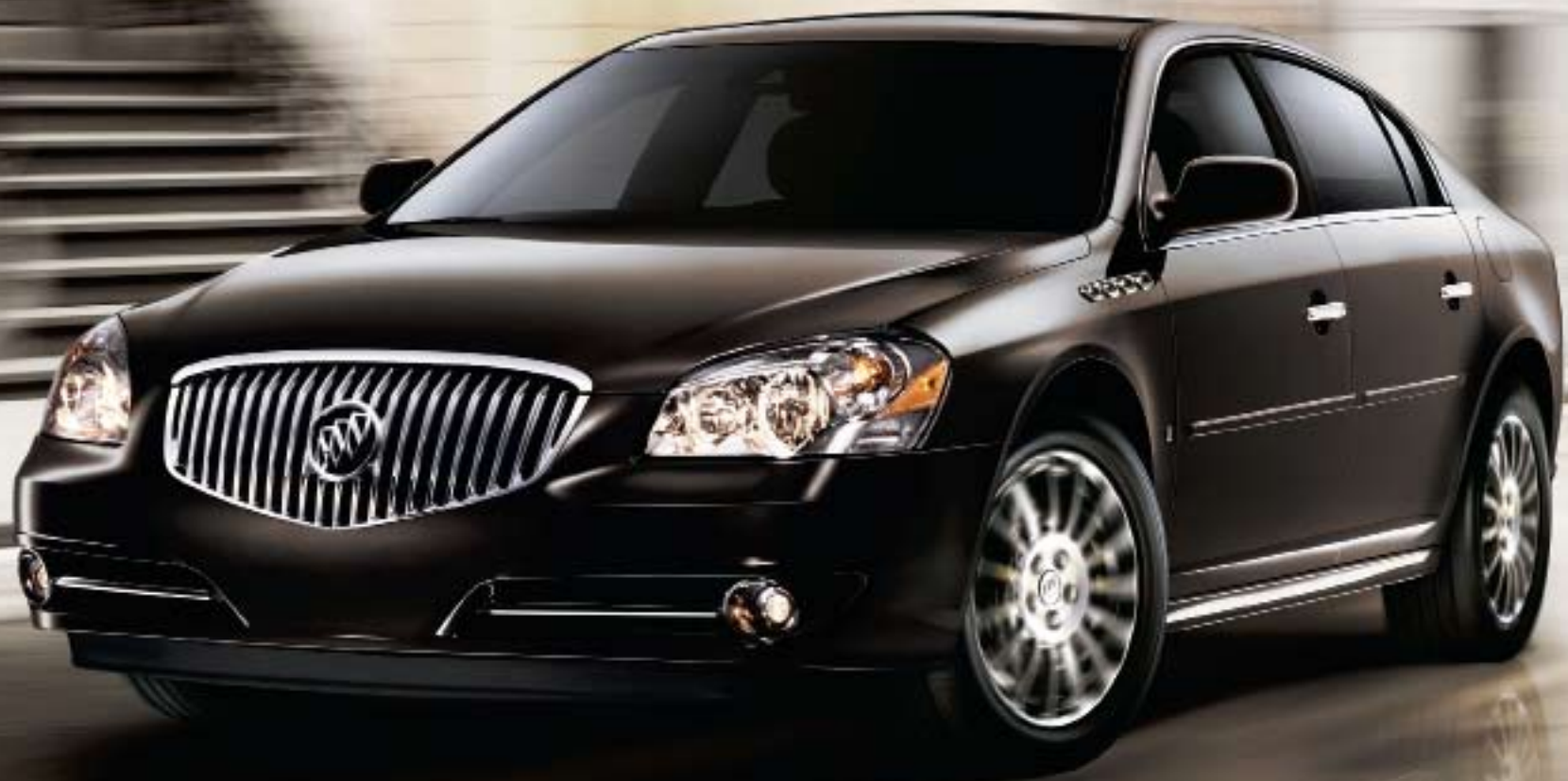
Lucerne Super shown in Dark Mocha Metallic with optional equipment.