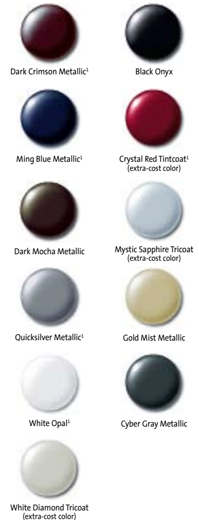
White Diamond Tricoat (extra-cost color)